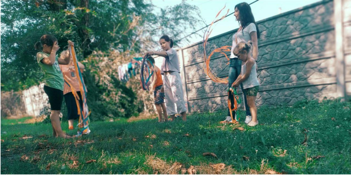
Child Friendly Space NGO Resource Center – Ukraine