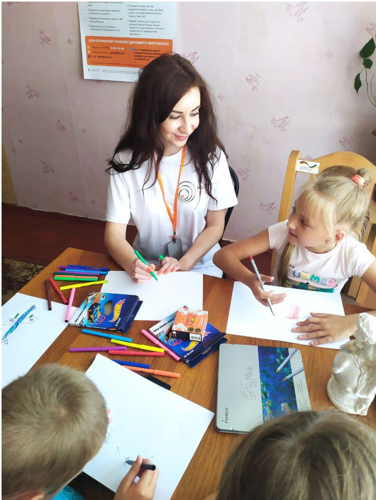
Child Friendly Space NGO Resource Center – Ukraine