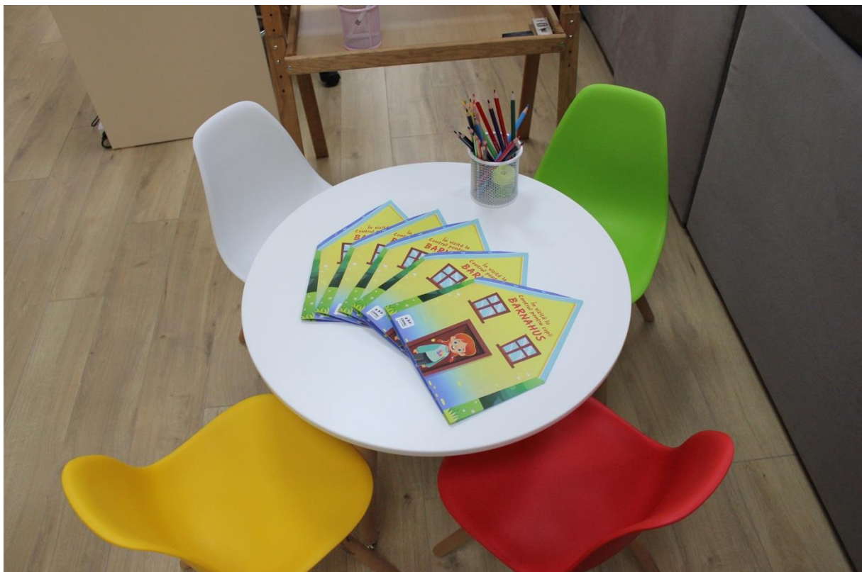
Barnabus in Moldova opened in March 2022. Here children will meet professionals with accurate competence to receive and meet children that suffered from sexual abuse and who carry trauma from the invasion.