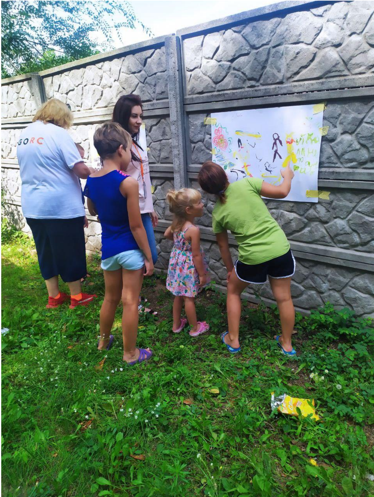
Child Friendly Space NGO Resource Center – Ukraine