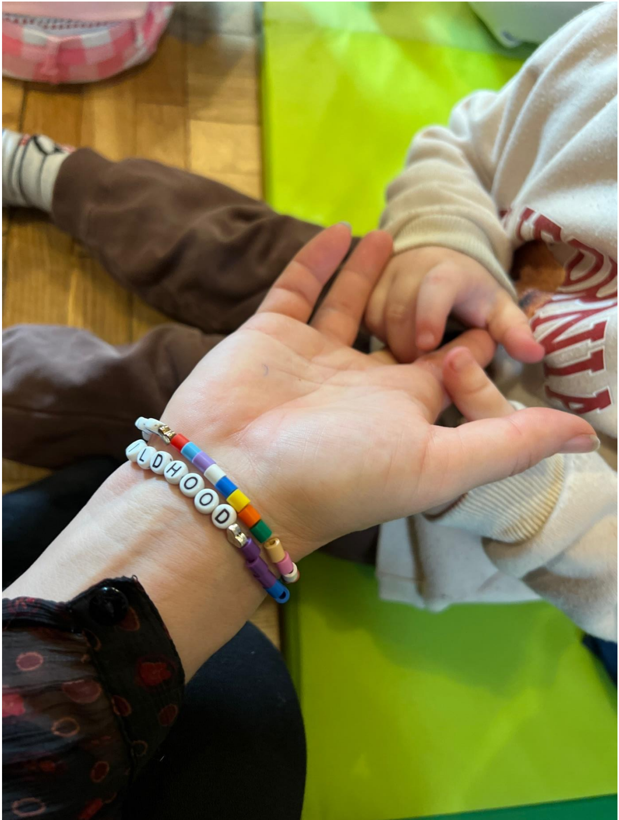
Comenius Foundation – Poland