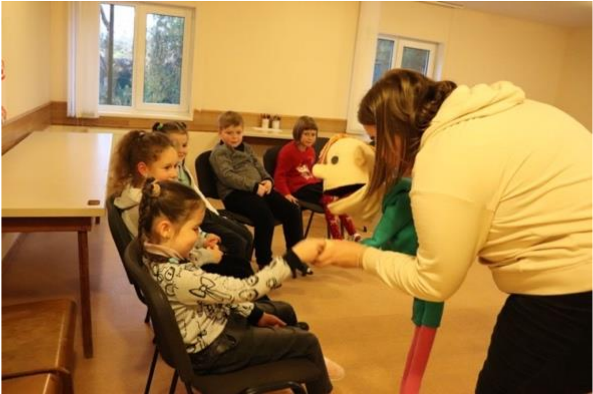
Healthy Society Ukraine, Support group for refugee children. Before the invasion, children wished for sweets and birthday gifts, now they wish for their fathers to come home, sirens and explosions to stop and to return to their homes.